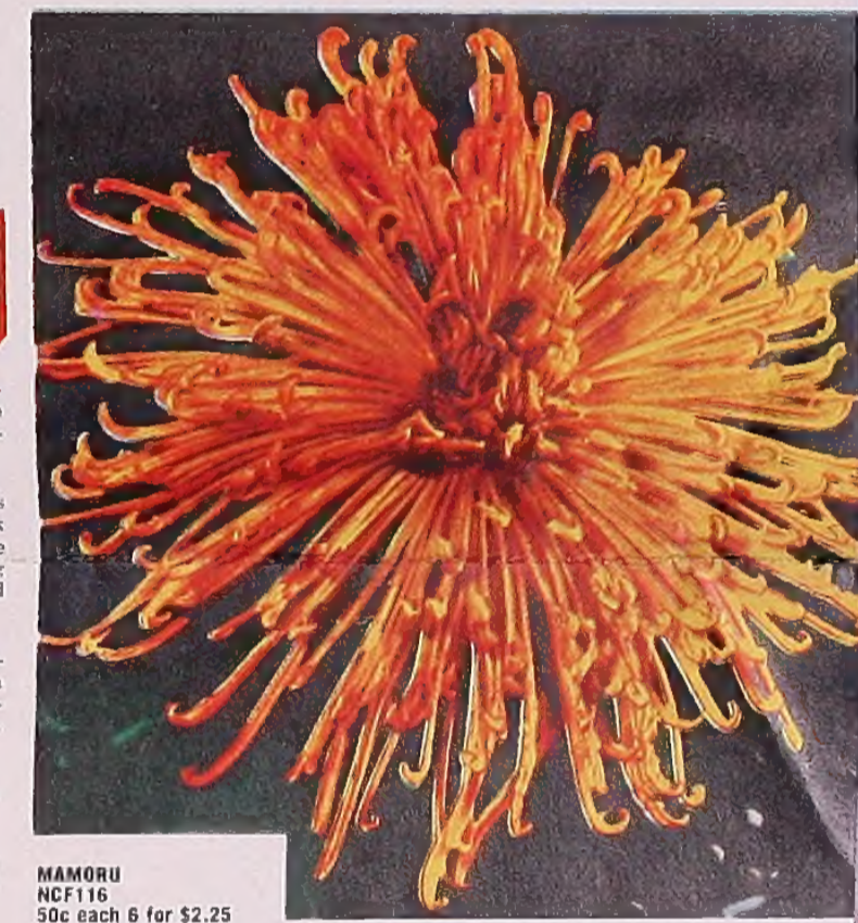
MAMORU NCF116 50c each 6 for $2.25